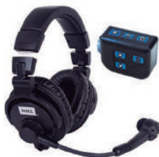
6X OPEN MIC HME WIRELESS INTERCOM HEADSET