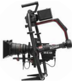
DJI RONIN 2