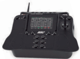
REMOTE CONTROLE SRH-3 w/ JOYSTICK