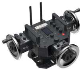
DJI MASTER WHEELS