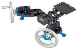
DRW-1 TWO WHEELS SETUP