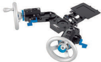
DRW-1 TWO WHEELS SETUP