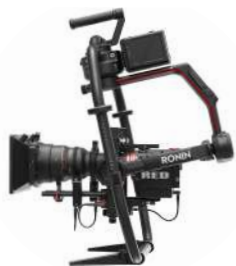
DJI RONIN 2